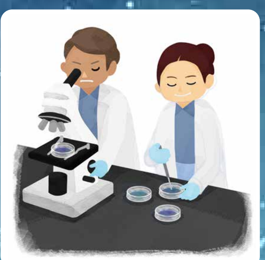
Do Not Miss

Continuously monitor to find antimicrobial-resistant bacteria.